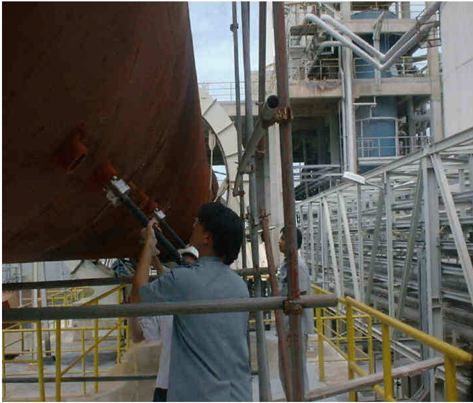
Tubes are activated and removed