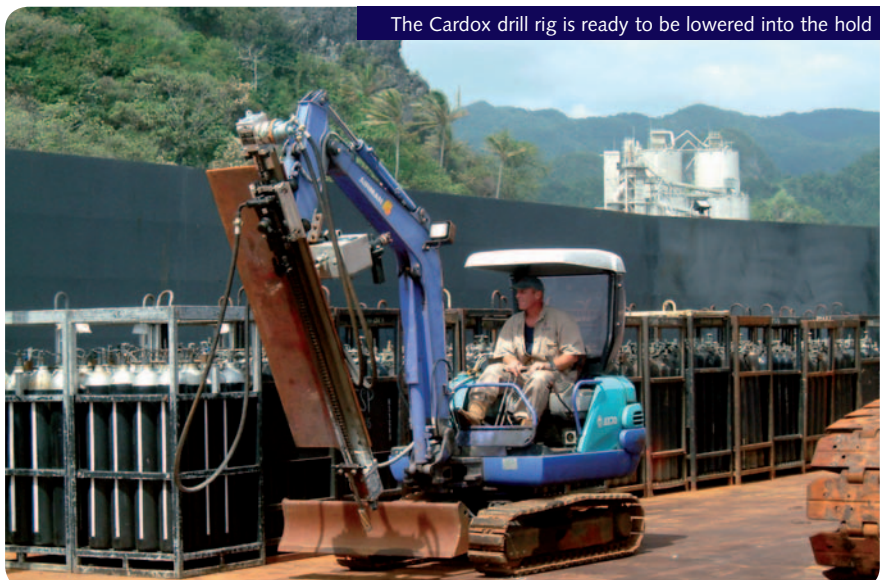
The Cardox drill rig is ready to be lowered into the hold