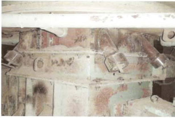
Figure 1. Cardox Angled Sockets allow access to the heart of the buildups and blockages.