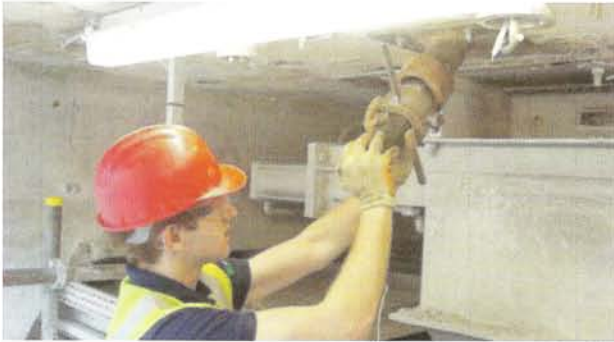
Figure 3. Cardox operative inserts and locks the specially designed silo tube into an Angled Socket.

installed around the discharge valves, which allowed Cardox Tubes to be inserted up into the heart of the buildup.